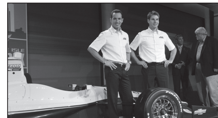
Team Penske drivers Helio Castroneves, and Will Power.