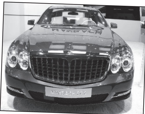
A very expensive Maybach is polished to a mirror finish.