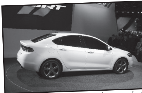
Dodge renews the "Dart" namesake as a modern sedan.