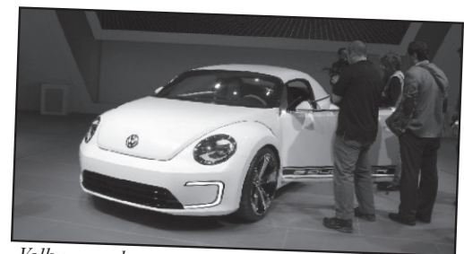
Volkswagen has reinvented the iconic Beetle and has visually brought it into the new century.