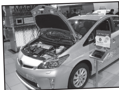
Hybrid cars and electric vehicles have flooded auto shows in recent years.