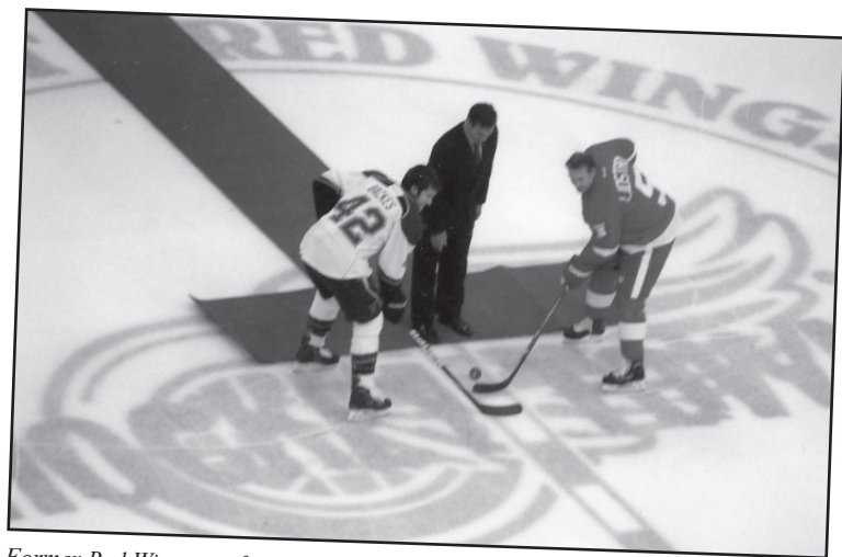
Former Red Wing star & and USA Hockey Hall of Fame 2011 inductee Chris Chelios drops the ceremonial opening face-off puck on Dec. 31, 2011 at Joe Louis Arena prior to the Red Wings/St. Louis Blues game.