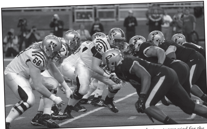
The line of scrimmage explodes with a flurry of action as the two teams vied for the title of Little Caesars Bowl Champions.

Western Michigan Broncos vs. Purdue Boilermakers at Ford Field. Red Wings vs. Blues at Joe Louis Arena.