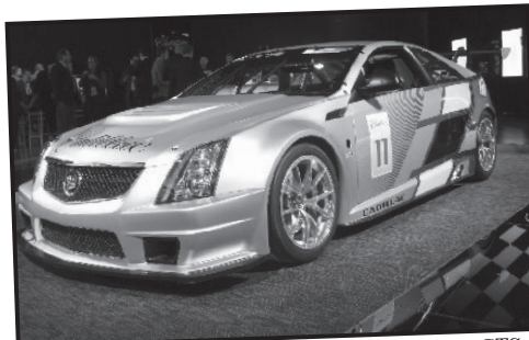
Cadillac exhibited a racing version of their CTS model.