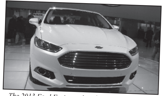
The 2013 Ford Fusion sedan shows off a racy front fascia.