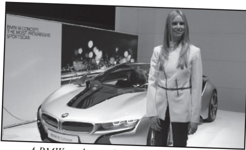
A BMW spokesmodel displays a futuristic new concept.