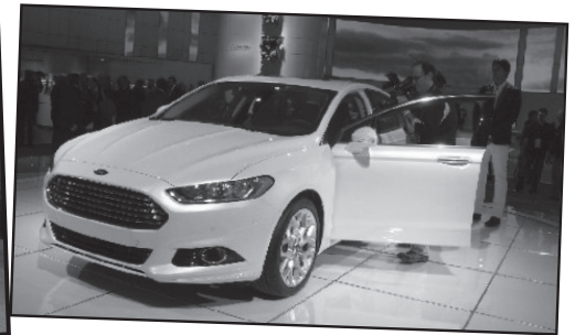
Edgy Ford Fusion styling appeals to young professionals.