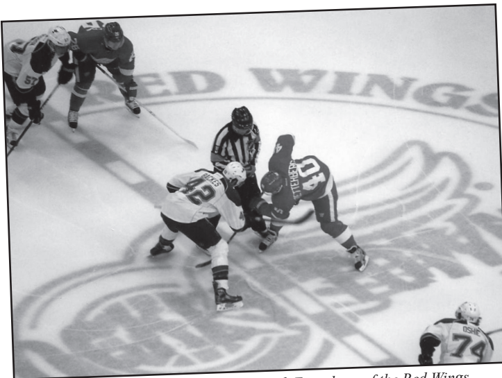
David Backes of the Blues and Henrik Zetterberg of the Red Wings.